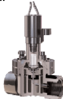
Typical Solenoid Valve

Run the irrigation system early in the morning. This is when water pressure is typically at its best. It is also best for the lawn.